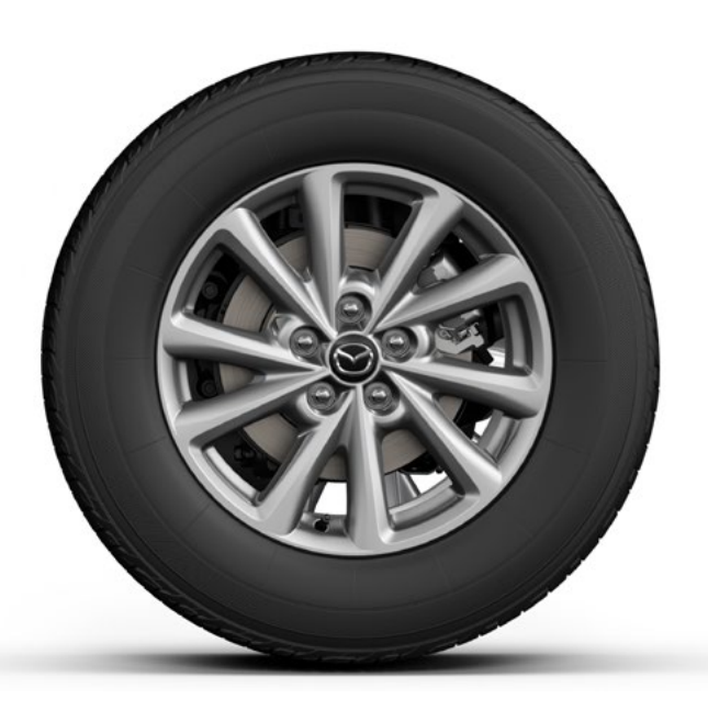
17" Metal Wheels (Silver Metallic)