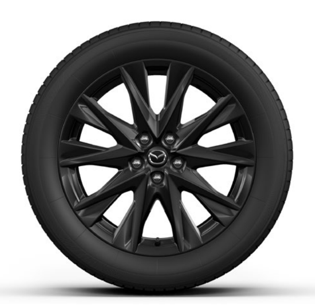
19" Aluminium Wheels (Black Metallic & Machining)