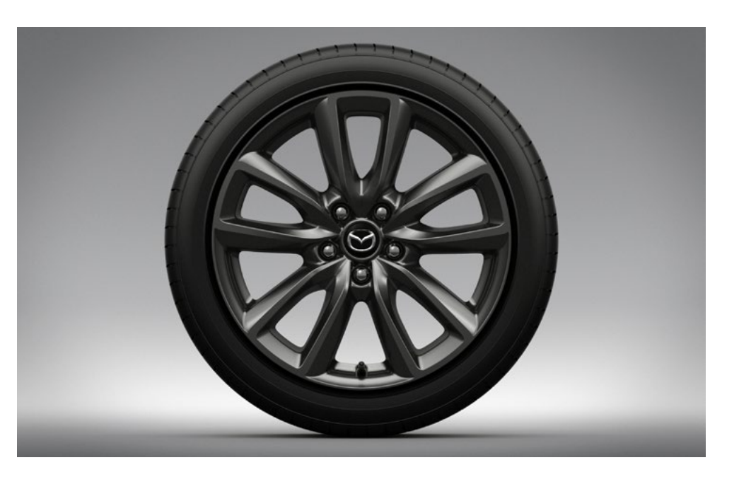
18" Alloy Wheels (Black Metallic)