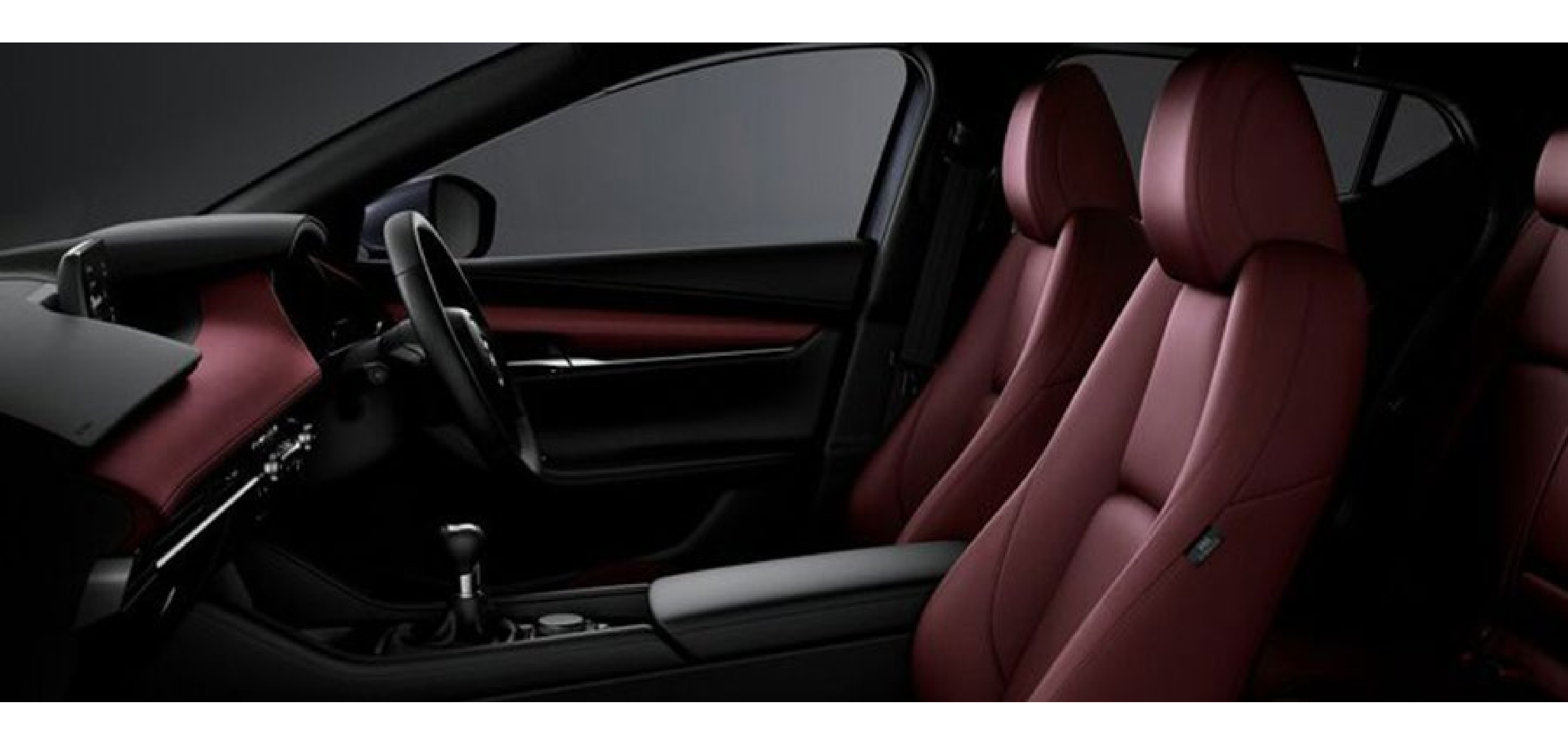
Burgundy Red Leather