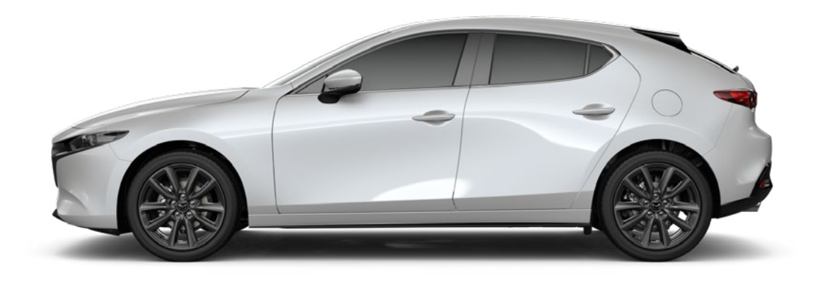
SNOWFLAKE WHITE PEARL